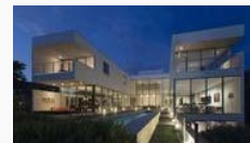
Dream homes: Hinsdale