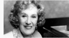
Notable deaths this year