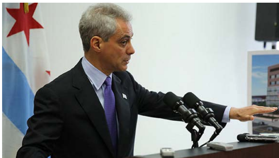
Mayor Rahm Emanuel at a recent press conference. (August 21, 2013)