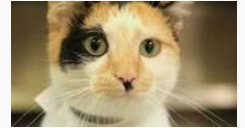
Pets in need of homes