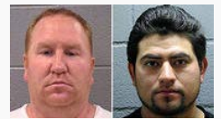
Mugs in the news

Chicago Tribune Charities A MCCORMICK FOUNDATION FUND