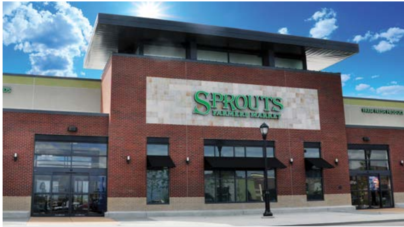
Sprouts Farmers Market, another grocer attentive to offering fresh goods, is also making its way into the Midwest market. The company successfully opened 24 stores across the country in 2014, including two in Kansas and one in Missouri.