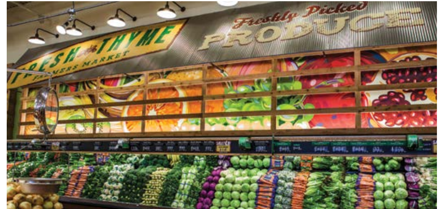
Fresh Thyme Farmers Market's 28,000-square-foot stores offer an abundance of produce, including locally sourced and organic fruits and vegetables and more than 400 bins of natural and organic bulk items.

The Kroger Co., which posted fiscal 2014 sales of $108.5 billion, continues to gradually roll out the Kroger Marketplace concept. These big-box stores span 100,000 to 125,000 square feet, twice the size of the supermarket chain's typical grocery stores. In Indiana, two of the stores are already open in Fort Wayne and two stores